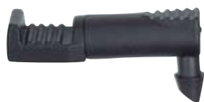
Midi Drip™ Barb 0.16"