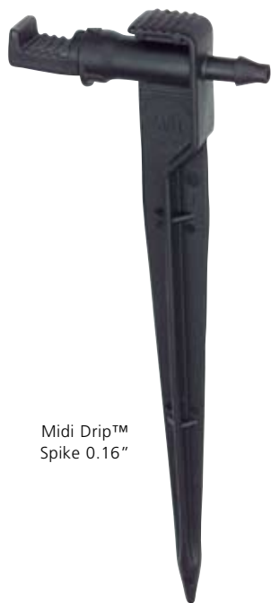
Midi Drip™ Spike 0.16"